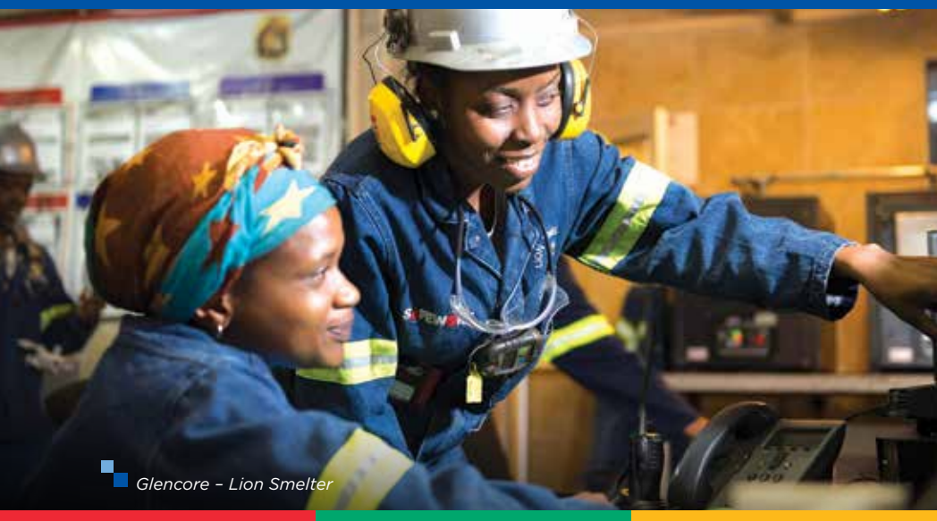
Glencore - Lion Smelter

Formerly the Chamber of Mines of South Africa