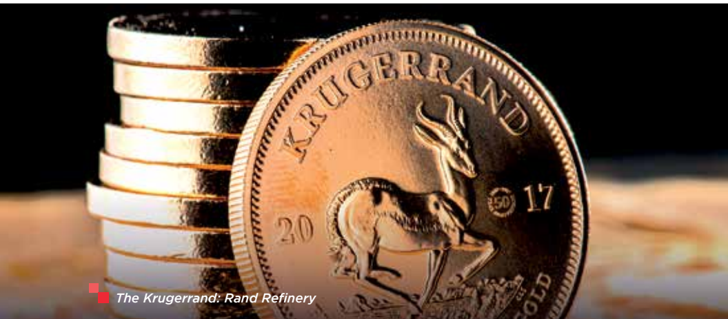
The Krugerrand: Rand Refinery