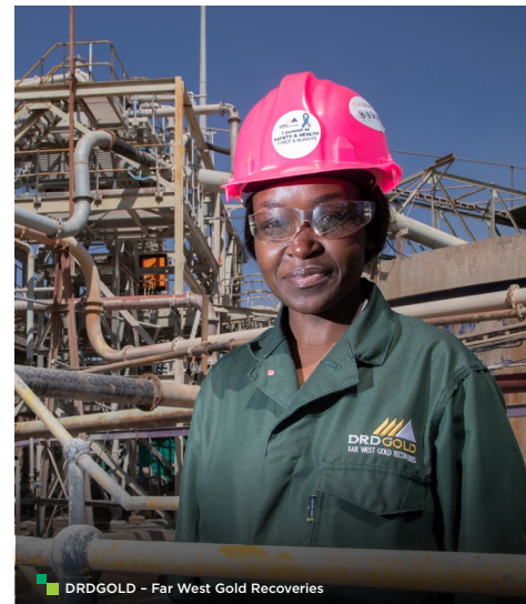
DRD GOLD - Far West Gold Recoveries

Women-owned businesses received an average 31% of total procurement spend over the 2020-2022 period