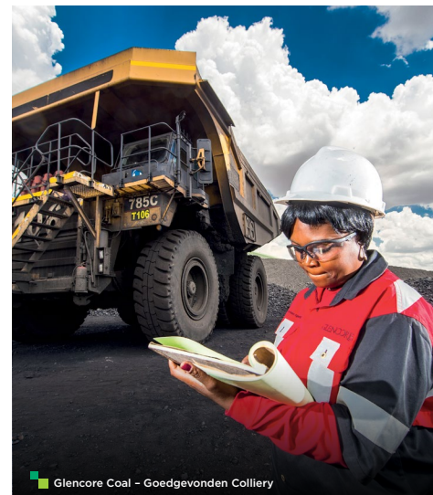
Glencore Coal - Goedgevoonden Colliery