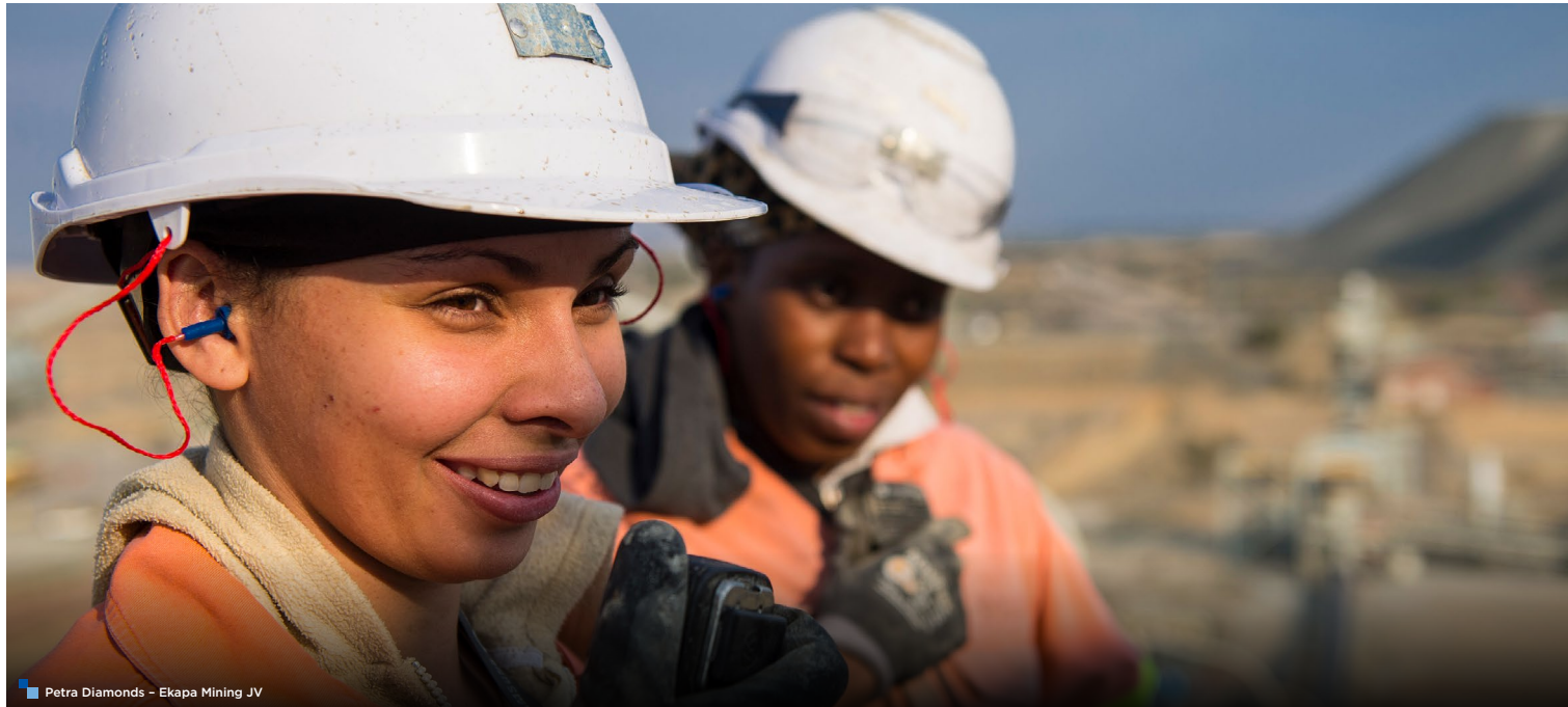
Petra Diamonds - Ekapa Mining JV

of safety heroes through initiatives such as the Minerals Council Women in Mining annual heroes campaign adds a human touch, highlighting safety excellence, inspiring others, and increasing awareness of safety issues in a more engaging and relatable manner. It demonstrates that the mining industry is a viable, long-term career option for young women.