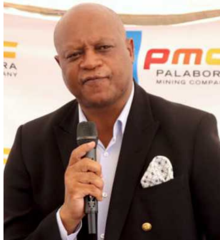
Cllr. Seaparo Sekoati (Limpopo MEC Treasury)