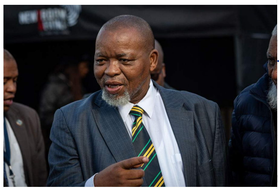
Minister Gwede Mantashe has invited industry to engage on the new draft mining law.