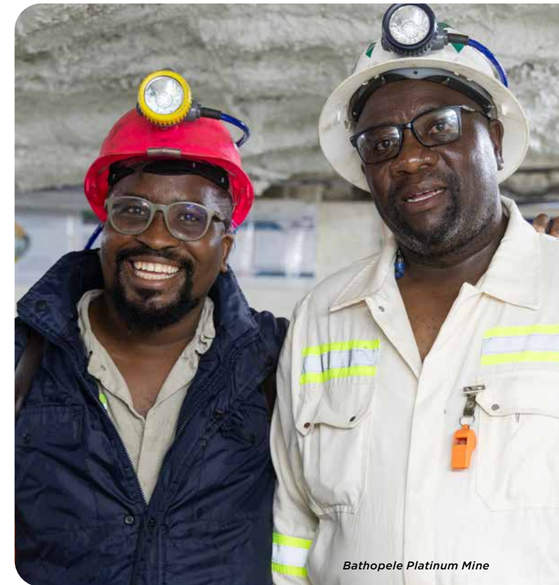
Bathopele Platinum Mine

https://www.mineralscouncil.org.za/about/members