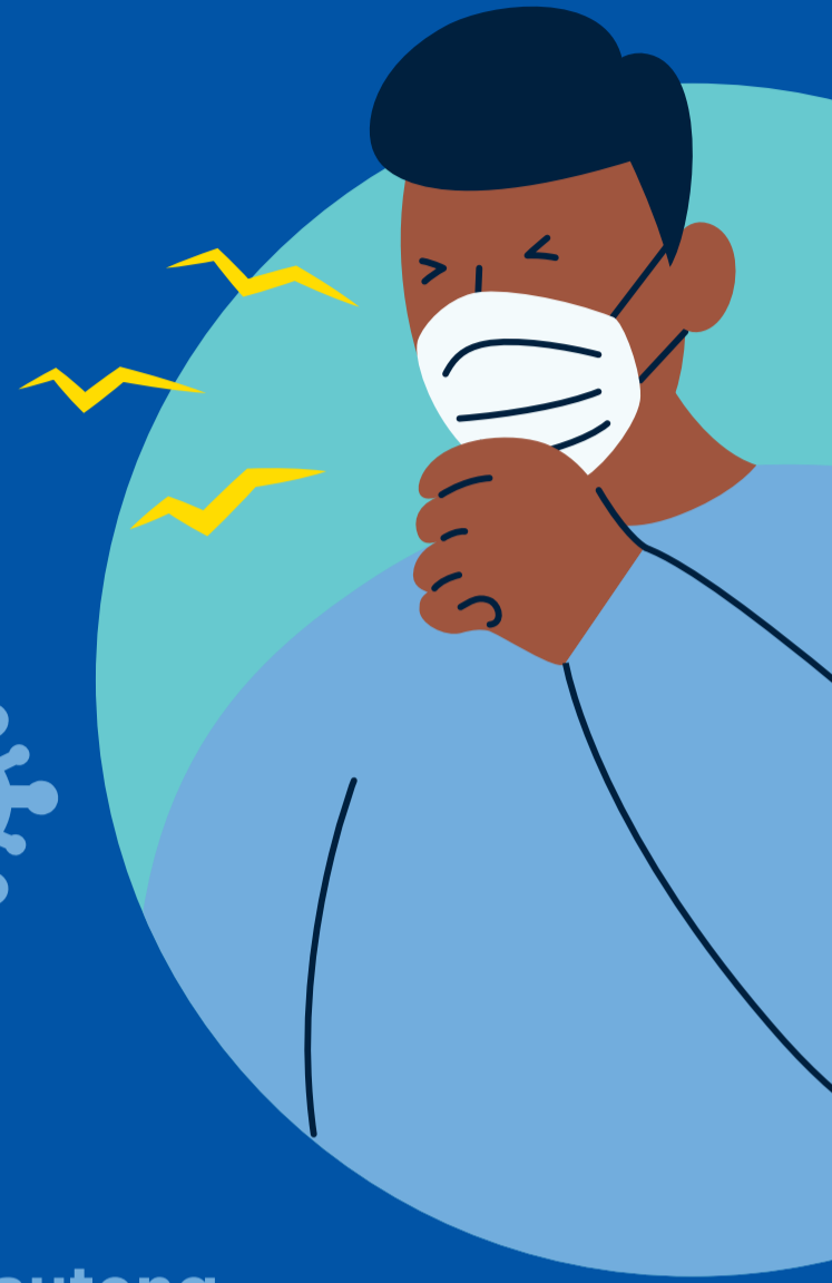
Amaza eemeko ze-COVID-19 eGauteng

Lusasazeka ngokulula ukusuka komnye umntu ukuya komnye, kwaye lubangele ukonyuka okumandla kubantu abosulelekayo.