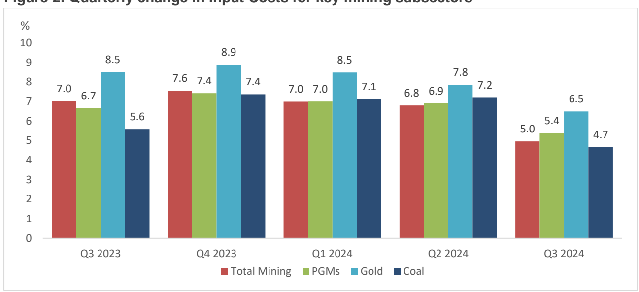
Figure 2: Quarterly change in Input Costs for key mining subsectors

In the third quarter (Q3) of 2024, mining input inflation settled at 5%, a reduction from the 7% recorded during the same period last year. Among key commodities, gold continued to experience the highest rise in input costs, reaching 6.5% in Q3, down from 8.5% in 2023. Figure 2 below illustrates these quarterly trends, providing a comparative view of cost pressures across the past year.