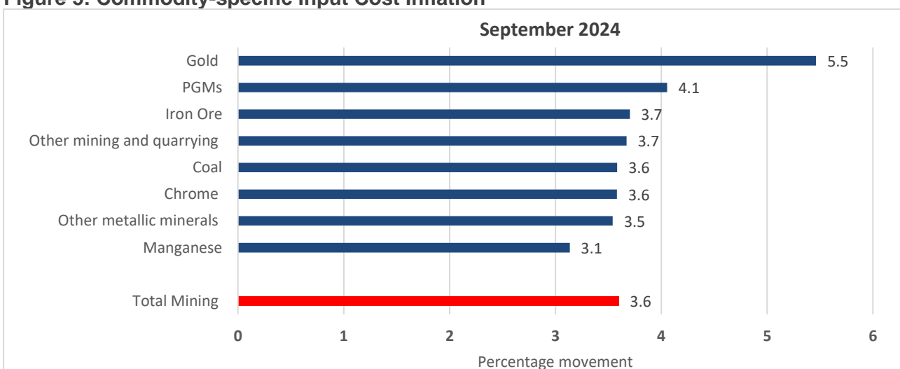
Figure 5: Commodity-specific Input Cost Inflation